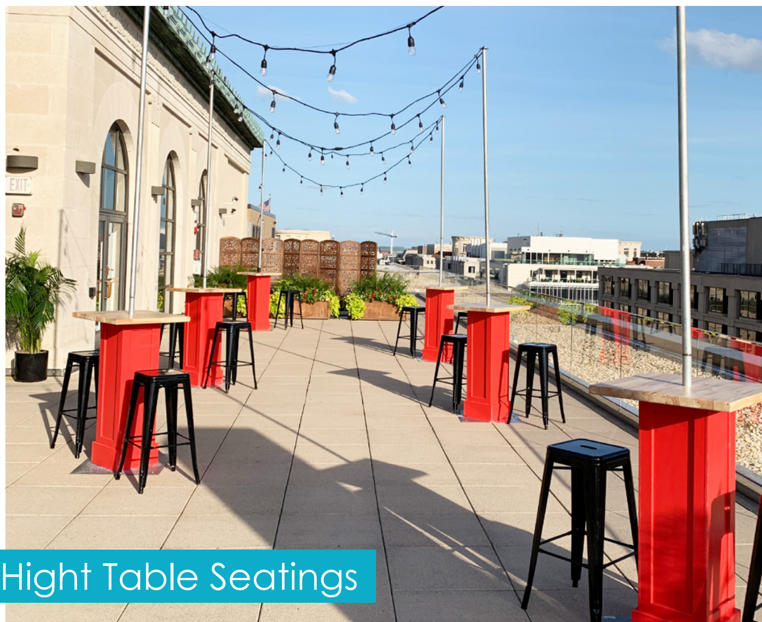
High Table Seatings