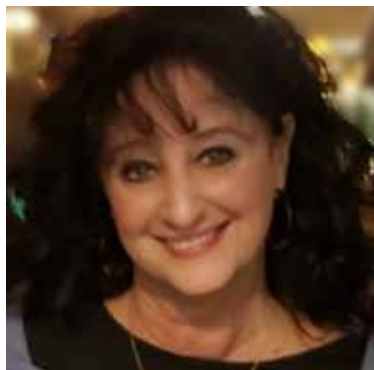
Senior Event Designer, Planner

A wedding...one of the most important days in every love story. The next step of the journey that a couple is about to take should be unique to the two of them. As a Designer/Planner, I can help create a wedding that will reflect this uniqueness. Whether a wedding is to take place in a Cathedral, Temple, barn, or a field, I create the romantic magic that continues to shape the love story. My forte is in the DETAILS, right up to the last moment!