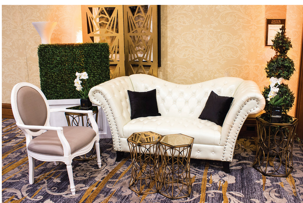
Lounge Seating Groups